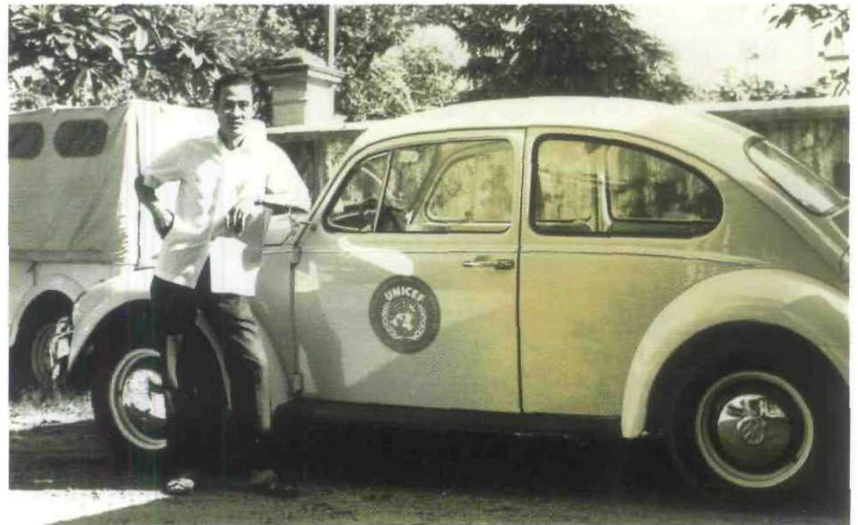
UNICEF vehicle used by Saigon office