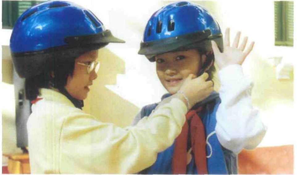
Young Vietnamese girls wearing motor bike helmets. Injury is now the biggest killer in Viet Nam for children 1 year and older. Viet Nam was the first country in the world to have a Childhood Injury Prevention project.