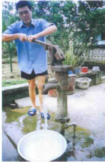
"No 6" water hand pump, adapted from those used in Bangladesh