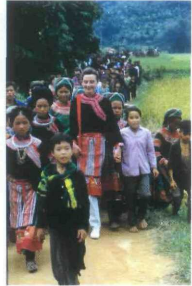
UNICEF Goodwill Ambassador, Audrey Hepburn visits Viet Nam