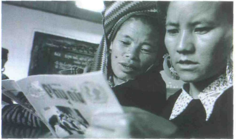
Two H'mong women attend a UNICEF training session on gender and development issues, using the publication "Facts for life"