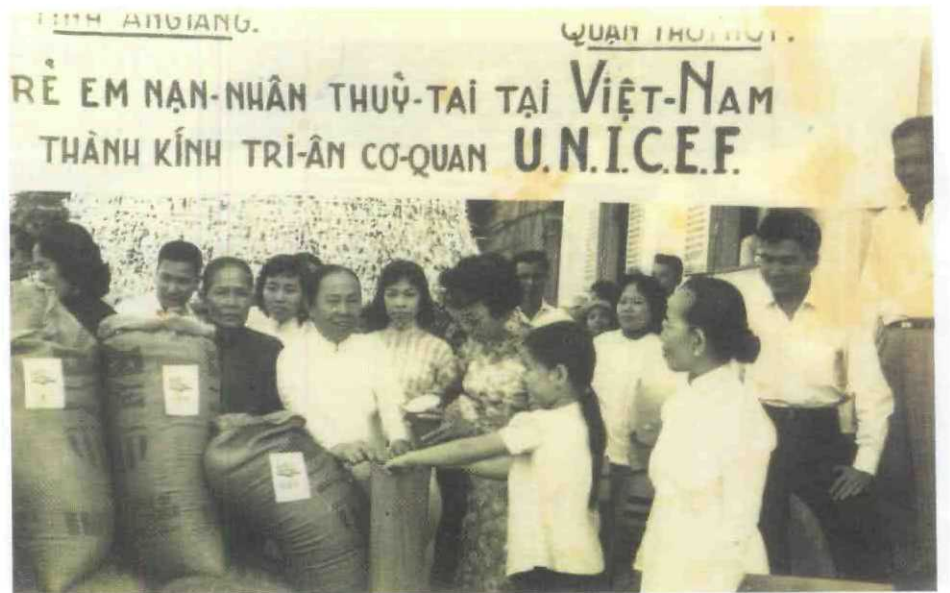
UNICEF delivering food supplies to flood victims